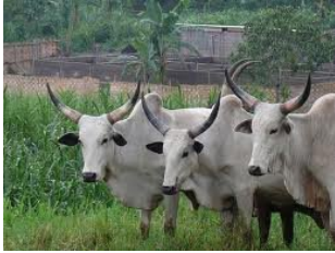
Zebu cattle in India