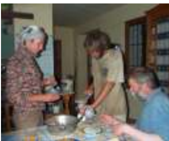
Trying our hand at sausage-making at home